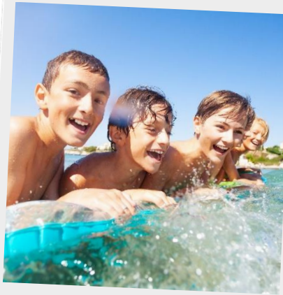
Creating lifelong friendships