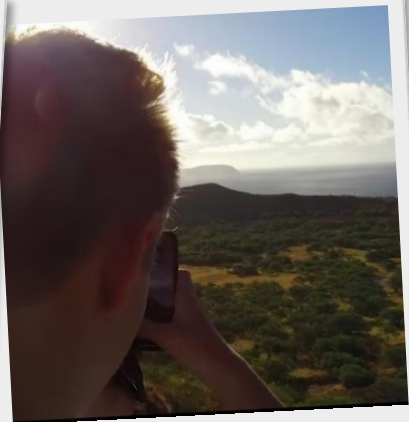
Expand your horizons