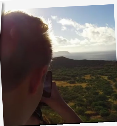
Expand your horizons